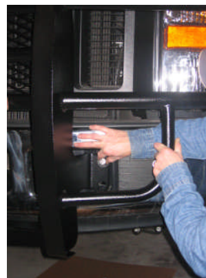
Fig 4 Driver's side