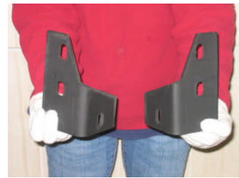
Fig 1, Stiffener Brackets.