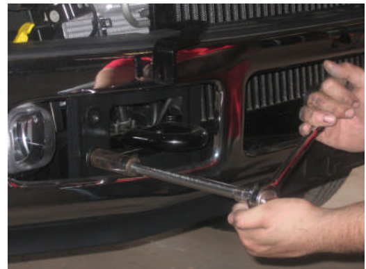
Fig 2. PASSENGER SIDE