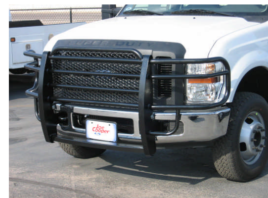
2008 FORD Superduty - One Piece Welded