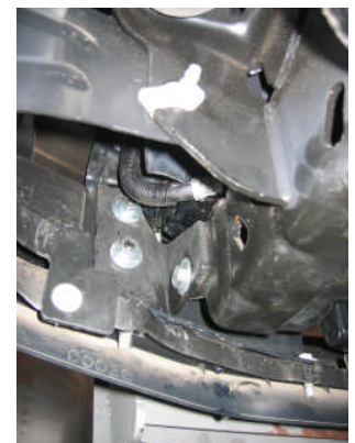
Fig 5 Driver's side

WARNING: Installation of this product can change the form, fit and function of the truck. People using the product do so at their own risk.