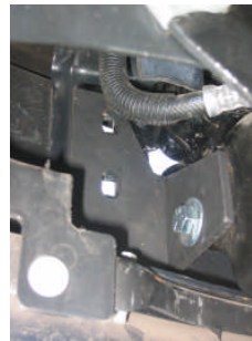
Fig 3 Driver's side Stiffener Bracket secure to the outside of the Frame Rail