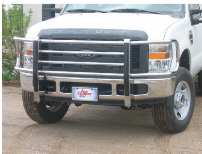
2008 FORD Superduty