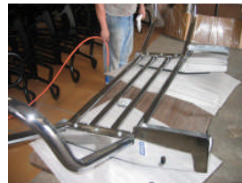
Fig 5 Grille Ring mounted to Uprights