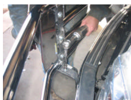
Fig 7. Tightening the Top of the Grille Guard to the Bracket

WARNING: Installation of this product can change the form, fit and function of the truck. People using the product do so at their own risk.