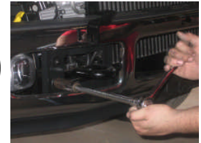
Fig 2. Removing Tow Hook bolts