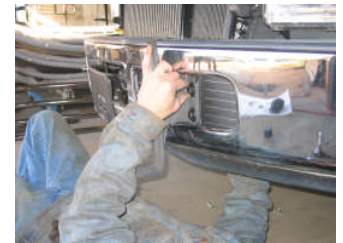
Fig 4 Driver's side bracket installed