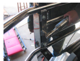
Fig 9. Tightening the Grille Ring to the Uprights