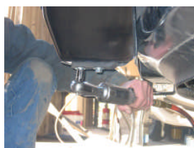
Fig 8. Tightening the Bottom of the Grille Guard to the Bracket