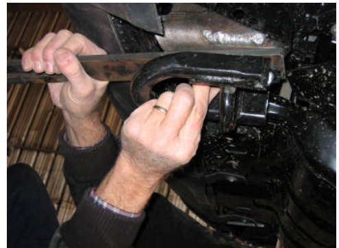
Fig 4. Driver's side Top & bottom brackets being installed w/Tow Hook