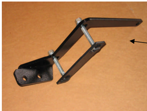
Fig 8 Driver's side top bracket and stiffener bolt plate