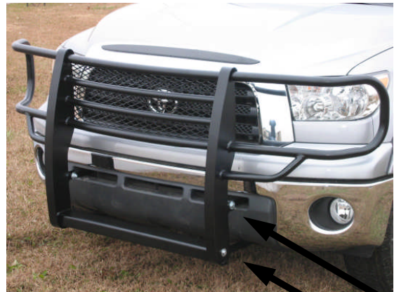
Fig 9 - Arrows pointing to hardware securing the Grille Guard to the Top & Bottom Brackets