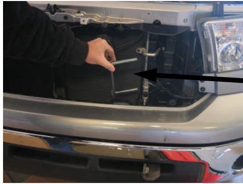
Fig 6, Installing the Driver's side stiffener bolt plate