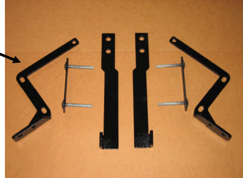
Fig 1. Brackets – Arrow points to Passenger Top Bracket