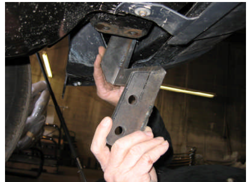
Fig 3. Driver's side Top Bracket being installed