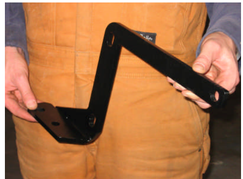
Fig 2. Driver's side Top Bracket