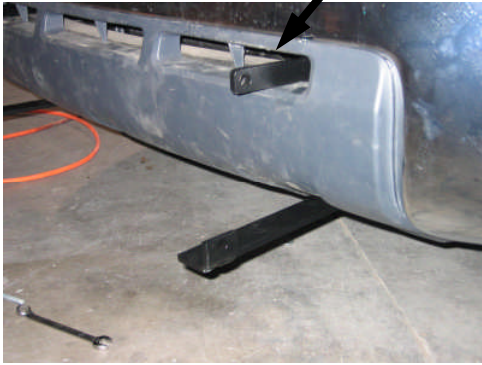
Fig 5, Driver's side brackets installed