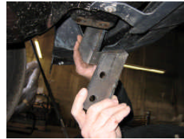
Fig 5. Driver's side Top Brackets being installed