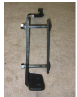
Fig 12 shows how the Top Bracket and Stiffener Bolt Plate fit together