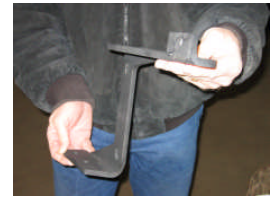
Fig 4. Driver's side Top Bracket