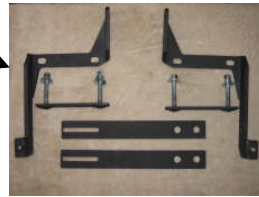
Fig 3. Brackets - Arrow points to Passenger Top Bracket