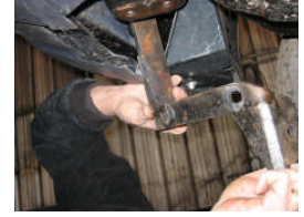
Fig 6. Passenger side Top Brackets being installed