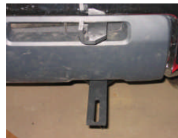
Fig 9 Driver's Side Bracket installed