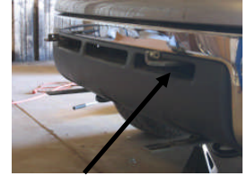
Fig 8 Arrow pointing to Bumper cut out