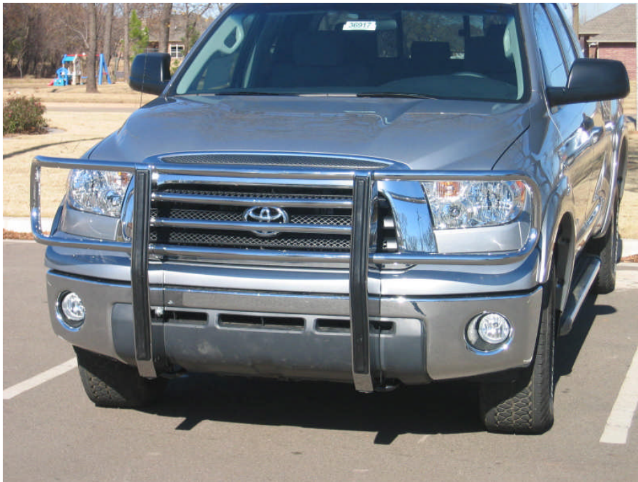
2007 Toyota Tundra