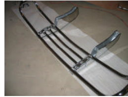
Fig 1. Grille Guard Assy